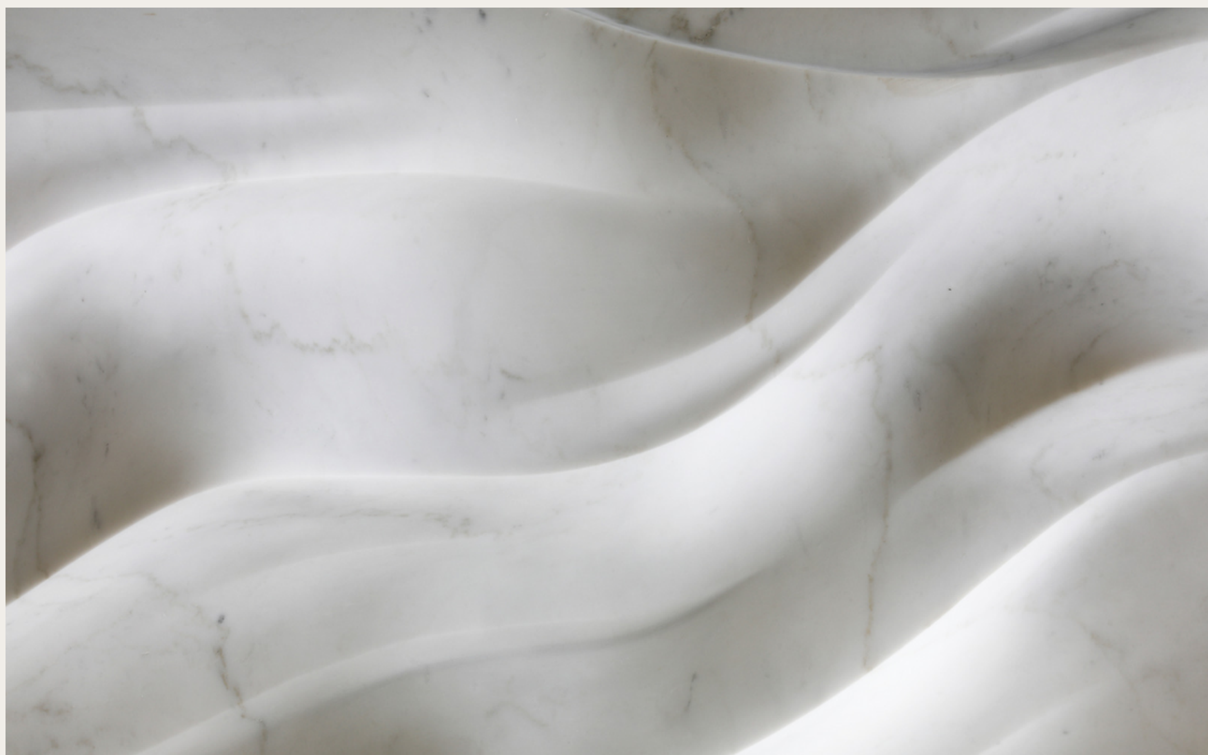
CALACATTA MICHELANGELO CARVED TO EMBODY THE MOVEMENT OF WATER